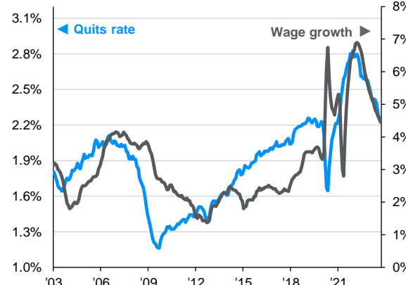
JOLTS quits rate and wages have declined in tandem Quits as % of employed, wages for PP&NS workers, 3mo. MA