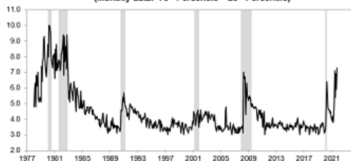
Inflation Uncertainty as Estimated by the Range of the Middle 50% in Inflation Expectations (Monthly data: 75 th Percentile – 25 th Percentile)

“Note that this was the first major spike in inflation uncertainty recorded outside of a recession. Even uncertainty about the long-term inflation rate was the highest in more than a decade. Declining living standards due to inflation were spontaneously mentioned by one-of-every five households, concentrated among older and poorer households.”